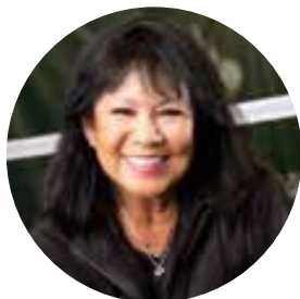
IRENE MAH Pickleball Pro