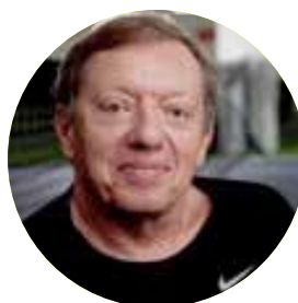
VADIM KORKH Tennis Pro